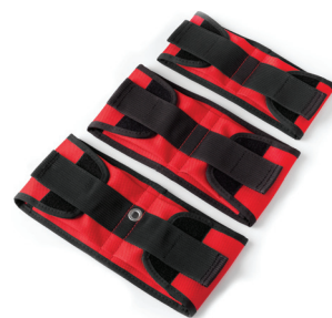
FLY Side weight pockets Red