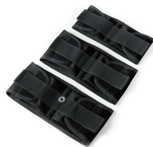
FLY Side weight pockets Black