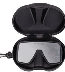
Softshell Mask Box