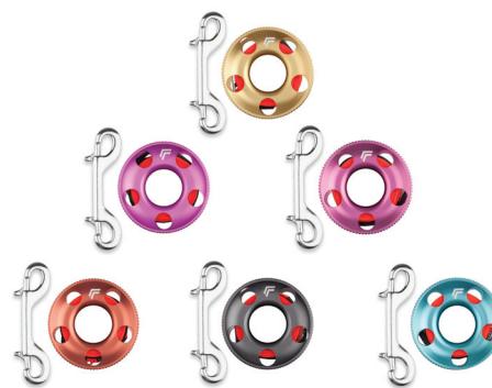
Alu Reel 15 m / ø 60 mm